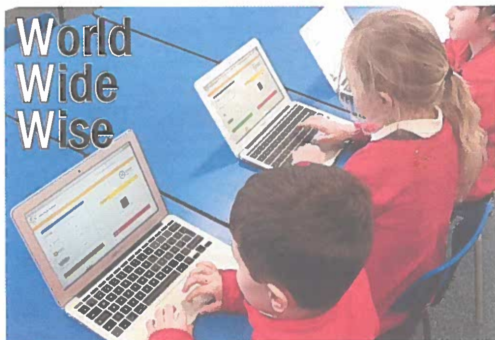
Children of Yarborough Academy using the school homepage to search safely.

Year 3 learned about why water is important. They used the film Frozen as inspiration for music and poetry and also designed boats and tested their sea-worthiness at Hubbard's Hills, in Louth.